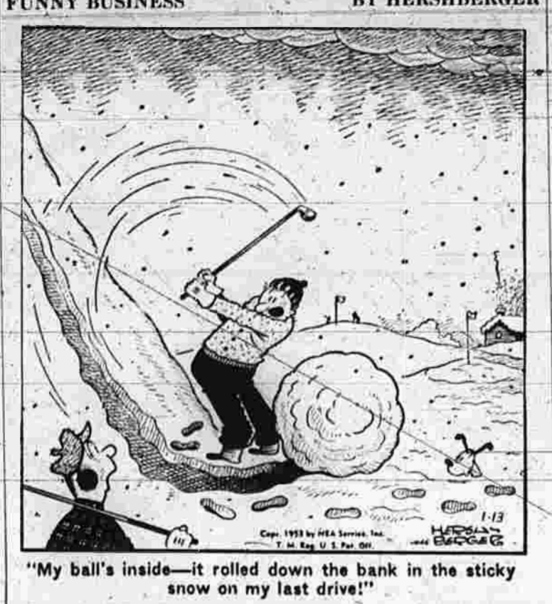
"My ball's inside—it rolled down the bank in the sticky snow on my last drive!"