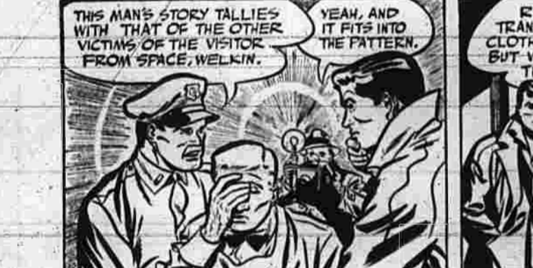
CHRIS WELKIN, Pianeter