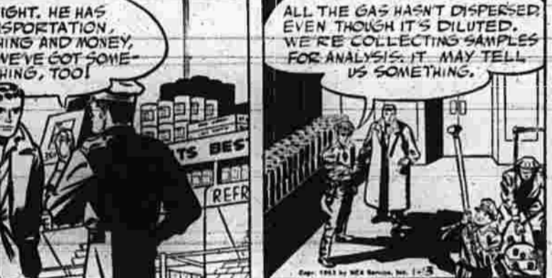
CHRIS WELKIN, Pianeter