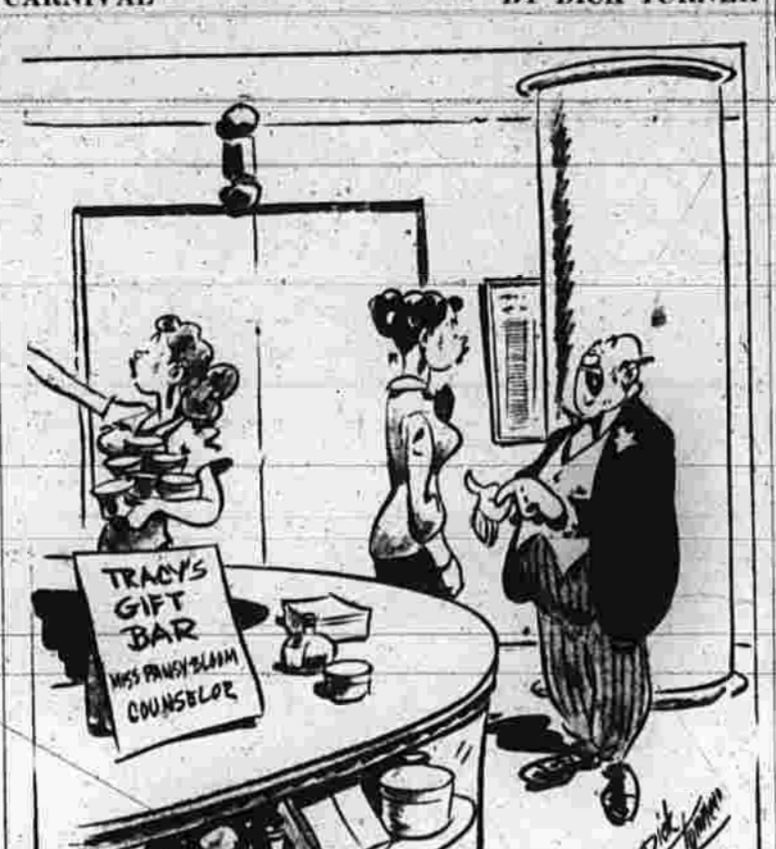
"As a gift counselor, Miss Bloom, your job is to see that each customer gets the right gift! This week it's those horrible luncheon sets we're stuck with!"