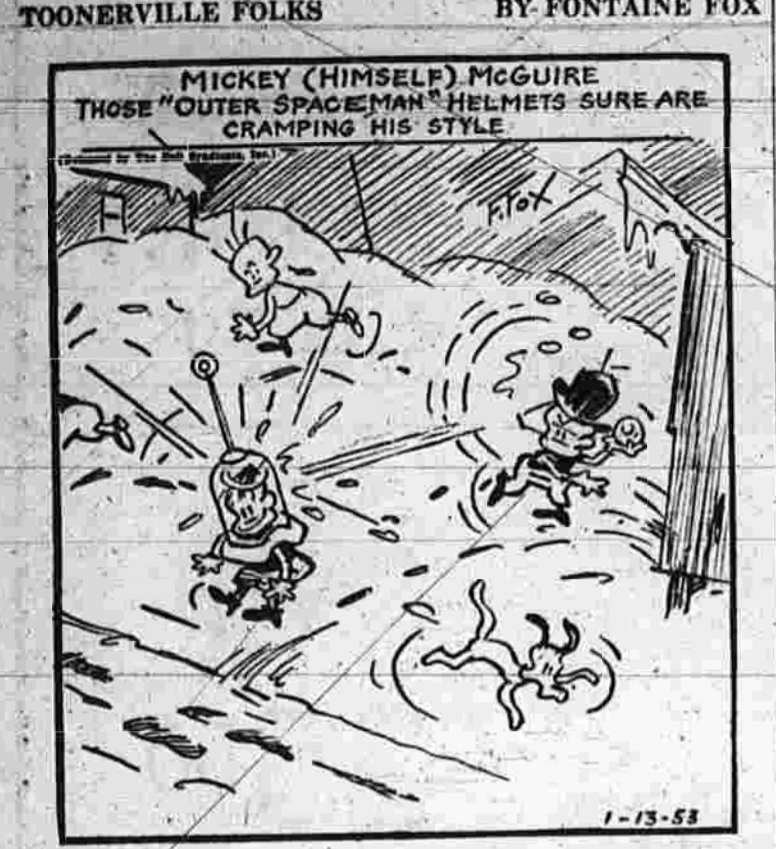
MICKEY (HIMSELF) MCGUIRE THOSE "OUTER SPACE" HELMETS SURE ARE CRAMPING HIS STYLE